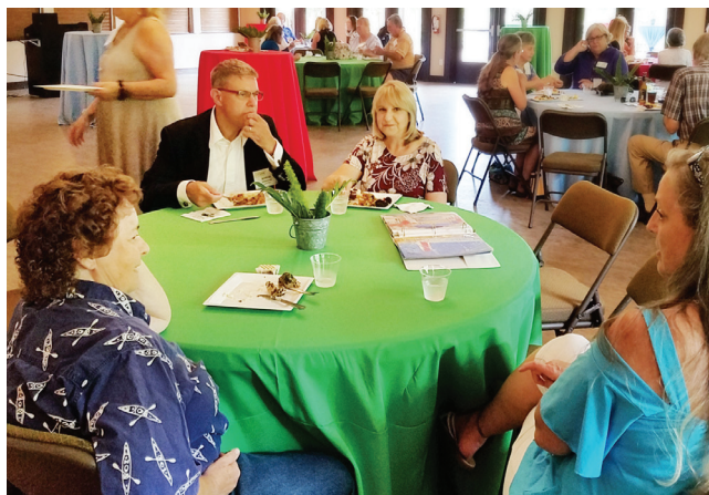
Local arts leaders mix, mingle, and network.