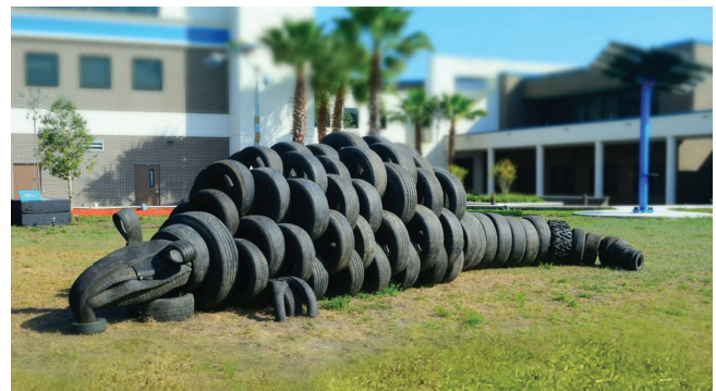
This year also featured a site-specific sculpture called "Carmadillo", created by a team of art students from De Montfort University Leicester in the UK.