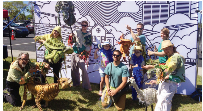
Ibex Puppetry, founded by the daughter of Jim Henson, comes to Brevard