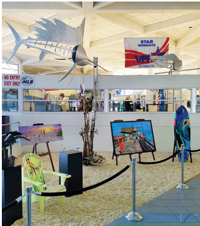
Travelers get a taste of local art at the Melbourne International Airport. Welcome to paradise!

“ [With BCA] we can make sure that everyone has a chance to feel connected to culture - an important part in everyone's life. ”