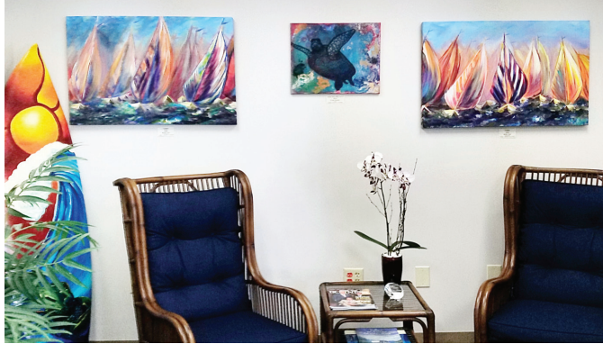
Lobby of Space Coast Office of Tourism featuring local art.